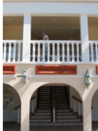
Longboat Key Learning Center

Students may also use our online appointment software to contact specific teachers for weekly appointments after tradition center hours. Students at the center have the opportunity to interact with other students, work with our teachers, and meet with school mentors to assess and review academic